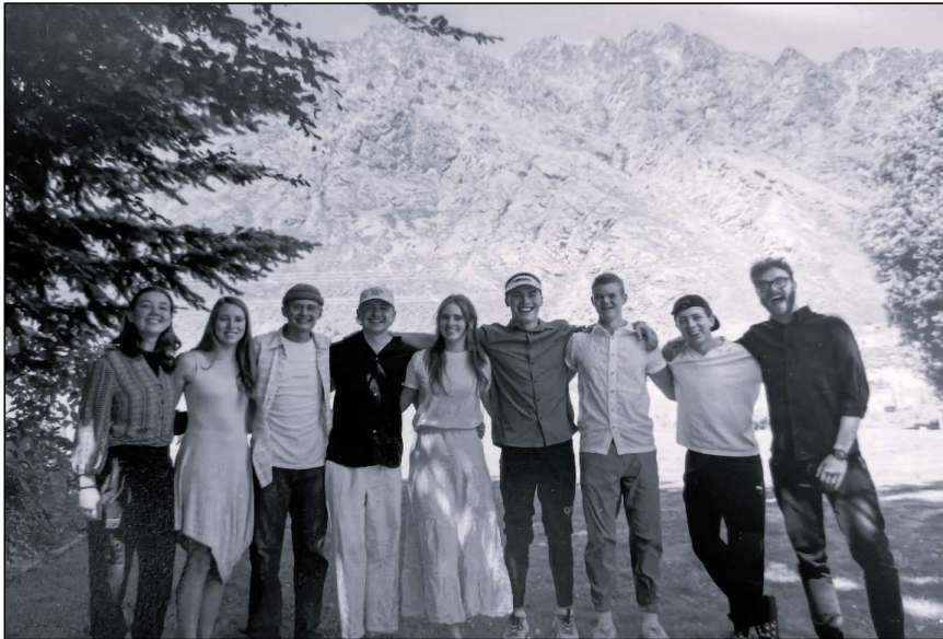
YWAM Queenstown 2024 DTS Team